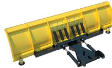
Trip Moldboard Plow Series STM-35/STM-28