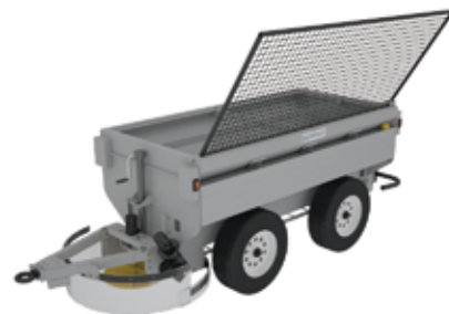
Tow Behind Salting Trailer 1 yd. / 2 yd.