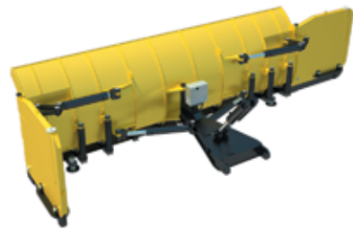
Power Sidewing Plow Series SW-48

View our full product line at www.machinability.com :