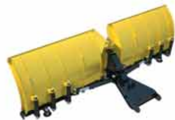
V-Plow Series V-48

View our full product line at www.machinability.com :