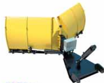
V-Plow Series V-35