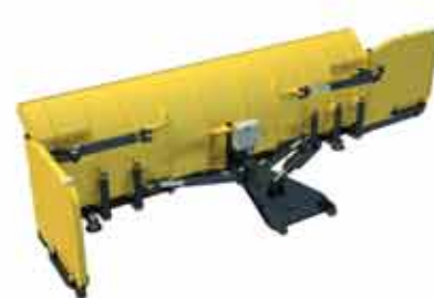
Power Sidewing Plow Series SW-48