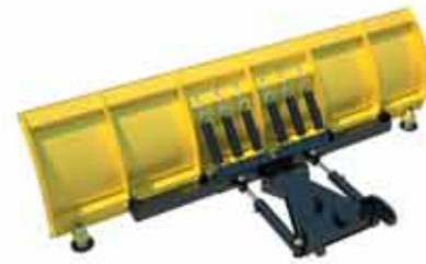
Trip Moldboard Plow Series STM-35 / STM-28