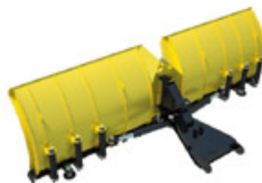
V-Plow Series V-35