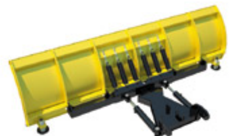
Trip Moldboard Plow Series STM-35 / STM-28