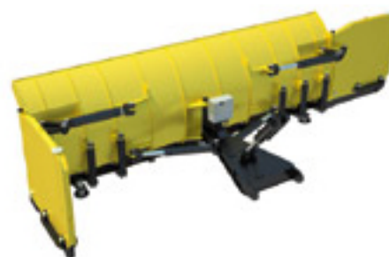
Power Sidewing Plow Series SW-48